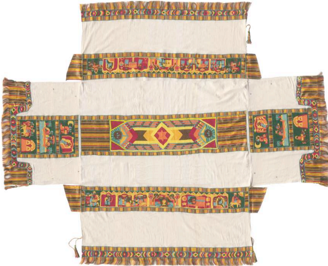
Ido Michaeli, Ethiopian Curtain of the Ark , 2012, Handmade embroidery on white hand loom woven cotton, 78.7 x 98.4 inches, Edition of 2.